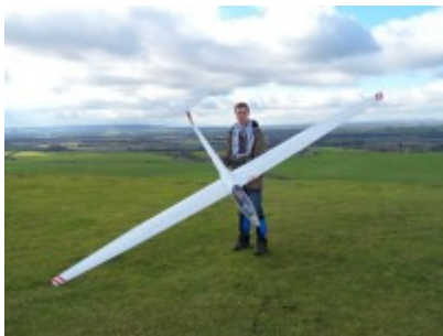
pics at last of maiden