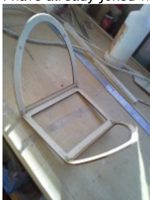
Finished canopy frame