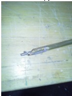
tube tow release