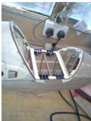
Canopy seat started