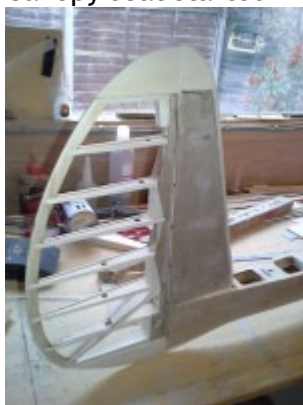
completed rudder and fin