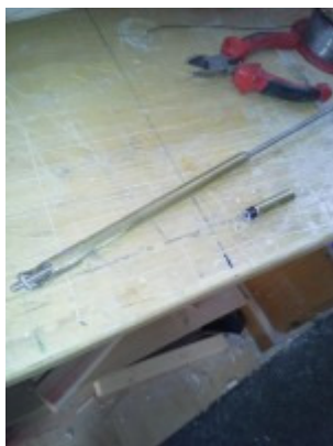
tube tow release