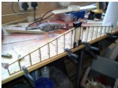
tail plane started