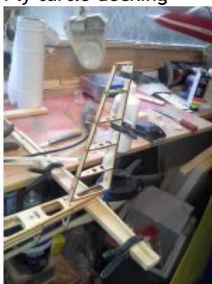
Fin construction and wanted to add.