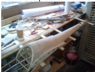
Ply turtle decking