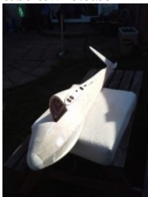
Nose block added that it reminds me of a sperm.....