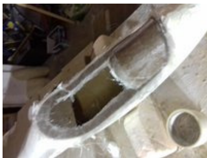
Pvc foam and glass 1 hours work